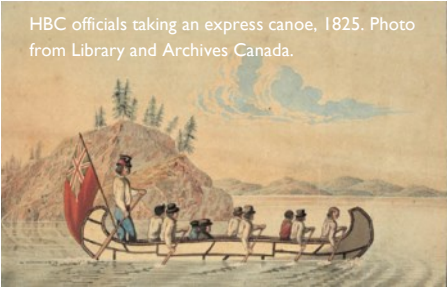
HBC officials taking an express canoe, 1825.

Lake Winnipeg is one of the most important bodies of water in Canada's history. The lake was a key transportation link between the Hudson Bay Company's port in York Factory and the fur trade hinterlands of the Red-Assiniboine watershed. Travelling on Lake Winnipeg and the Nelson River, traders were able to transport goods between Hudson Bay and the Red River Settlement in addition to the HBC's forts and outposts in between. York boats transported provisions to the HBC forts and returned with furs and trade goods.