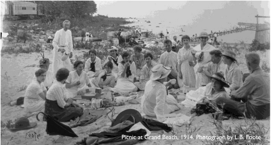
Picnic at Grand Beach, 1914.

Download this guide at www.RedRiverNorthTourism.com