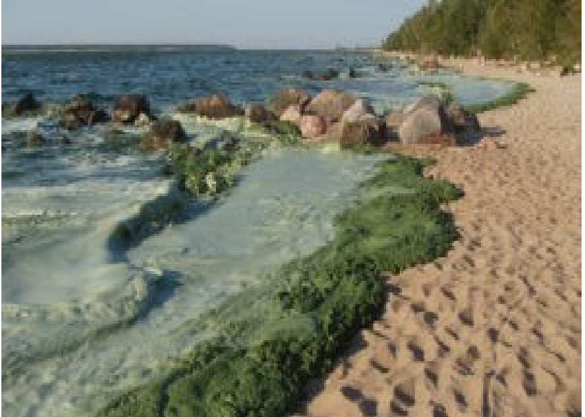
Foaming sludge resulting from phosphorous load on Lake Winnipeg..

In the last 30 years Lake Winnipeg has experienced a steady surge of blue-green algae growth. Algal blooms are the result of eutrophication—a condition caused by an over-abundance of the nutrient phosphorus. These blooms contaminate beaches, reduce water quality, and damage Manitoba's important fishing and tourism industries.