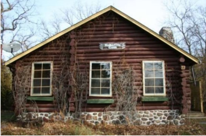
Saddle Notch construction detail

Broken Tree Cottage or the Kurtz Cottage, is a significant Grand Marais landmark. Built in the 1920s, this is the largest and most ambitious of the several distinctive log cottages that still stand in the community. Features to note are the saddle notch log construction, stone chimney and original interior details.