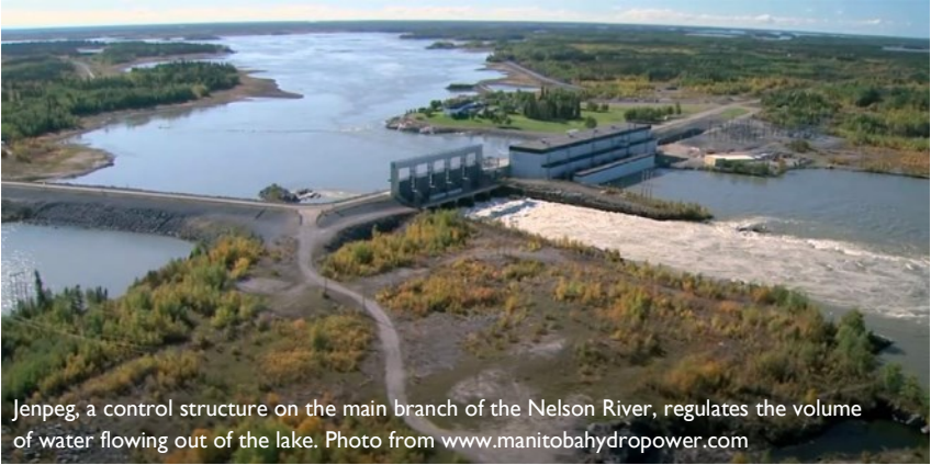
Jenpeg, a control structure on the main branch of the Nelson River, regulates the volume of water flowing out of the lake.

Lake Winnipeg is the world's third largest hydroelectric reservoir. Water flows through the lake into the Nelson River relatively quickly, over three to five years. (As a comparison, the waters of Lake Superior take 119 years to flow into Lake Huron via the St Mary's River). As the only outflow of Lake Winnipeg, the Nelson River has significant potential for hydroelectric power generation. Development began in 1966 and five power stations now meet 75% of the provincial demand.