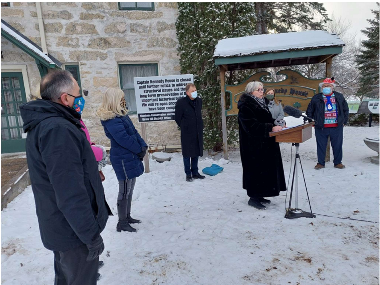
Kennedy House media announcement 17 December 2021.

RRNT continued to advocate for the reopening of Kennedy House . Discussions with the Province throughout the year culminated with the announcement in December of a commitment of $350,000 for the initial repairs recommended by the independent engineering firm, Crosier Kilgour & Partners Ltd.