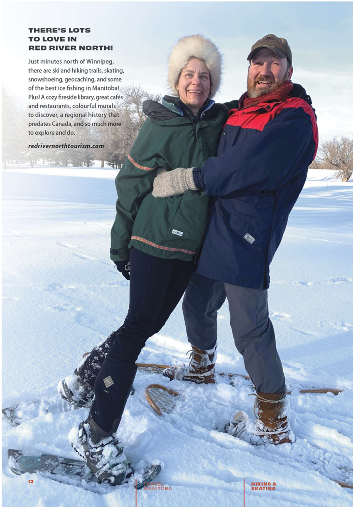
Travel Manitoba Winter Explorer Guide